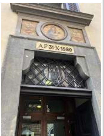
See Page 5 for another update on Fr David's visit to Rome.